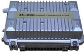
AC-460 Analog Audio/Video Transmitter